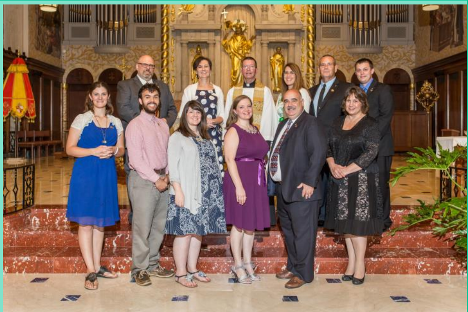
Class of 2016